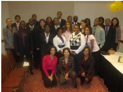
Induction of charter members, Fall 2008

CommonWEALTH of Scholars' mission is to create a community of role models to enhance, enrich and promote academic excellence amongst underrepresented groups on the campus of Virginia Polytechnic Institute and State University.