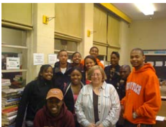
Community service project, Fall 2009

Our focus is to increase the presence of underrepresented students in the Virginia Tech Honors Program, to establish a network of undergraduate Scholars to facilitate the members' successful academic and social integration at Virginia Tech and to provide financial support to active Scholars and other academic opportunities.